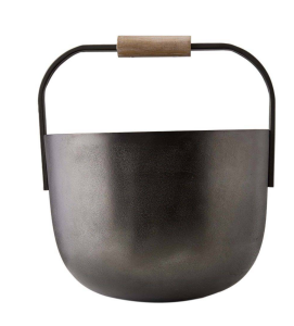
AFI02 H: 17.5 IN, Dia: 16.00 IN Blackened Aluminum

A fireplace accessory with serious presence, the Vermeer firewood basket is formed from blackened cast aluminum and features a wood handle of mango wood finished in smoke. The oversized vessel offers a stylish way to bundle logs, kindling or other home furnishings. Finish will vary.